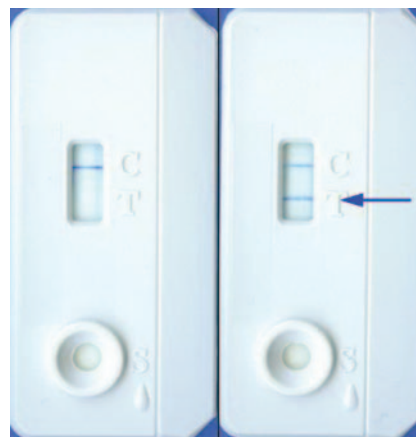
FIG. 1. The PrimaTB STAT-PAK assay, a rapid lateral-flow test for TB antibody detection in NHP. Shown are a negative result (on the left) and a positive result (on the right); in the test window, the upper line present in both devices is a control band; the lower line shown with an arrow is the test band indicating a positive result.

Antibody responses and antigen recognition. The humoral immune response during experimental TB was characterized in 14 rhesus monkeys infected with M. tuberculosis at the TNPRC and the University of South Alabama. To identify immunodominant antigens, MAPIA was performed with serum samples sequentially collected at different time points during in-